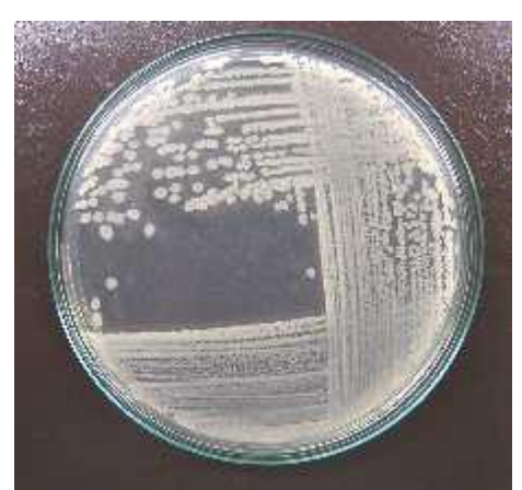
Figure 2: Colony morphology of strain JC3 on nutrient agar plate (Irregular, dry, white, opaque colonies) [ Sunil et. al. 2010 ]